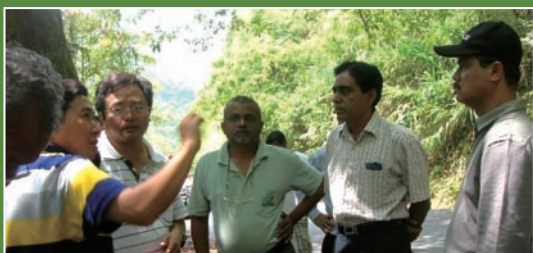
Field trip to communities