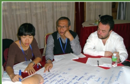
Working group discussion