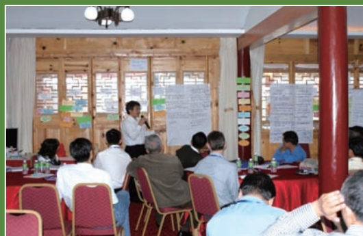
A participant's presentation