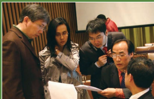
Chinese delegation in discussion