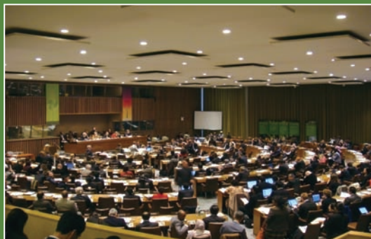
Plenary Session of UNFF 8

During the meeting, the APFNet introduced the missions, objectives, especially works underway and future plans of APFNet, and answered questions, drawing a great attention among participants. In the conference margin, APFNet held discussions with FAO and TNC respectively on upcoming cooperative activities, an informal meeting with AFP on future cooperation was also held.